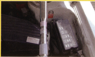
Use Torque Wrench