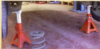
Support Vehicle Safely require