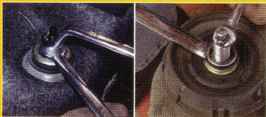
Use Flats, NOT adjuster, while tightening