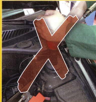
Never Use impact Wrench